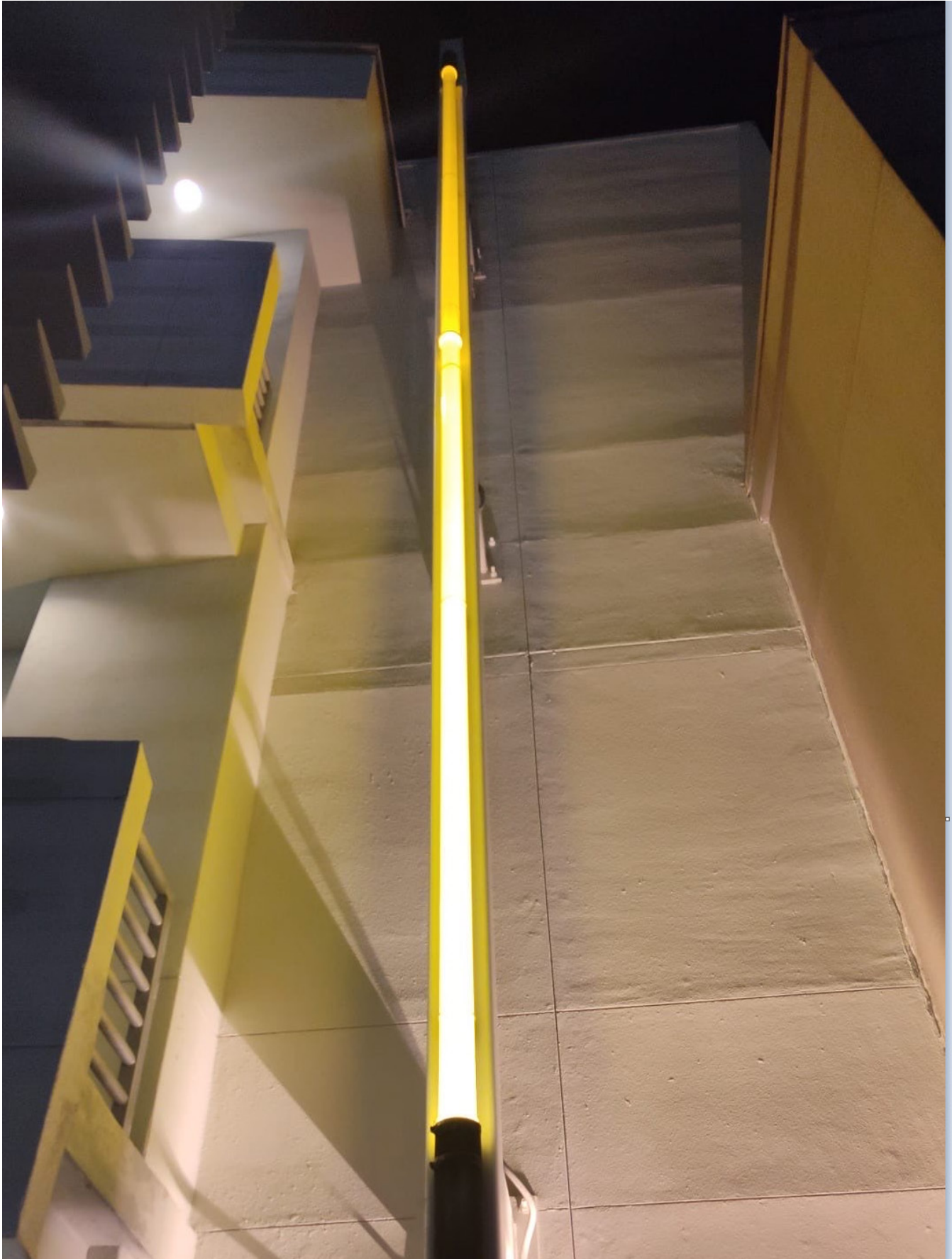
EXHIBIT A Tube Lights