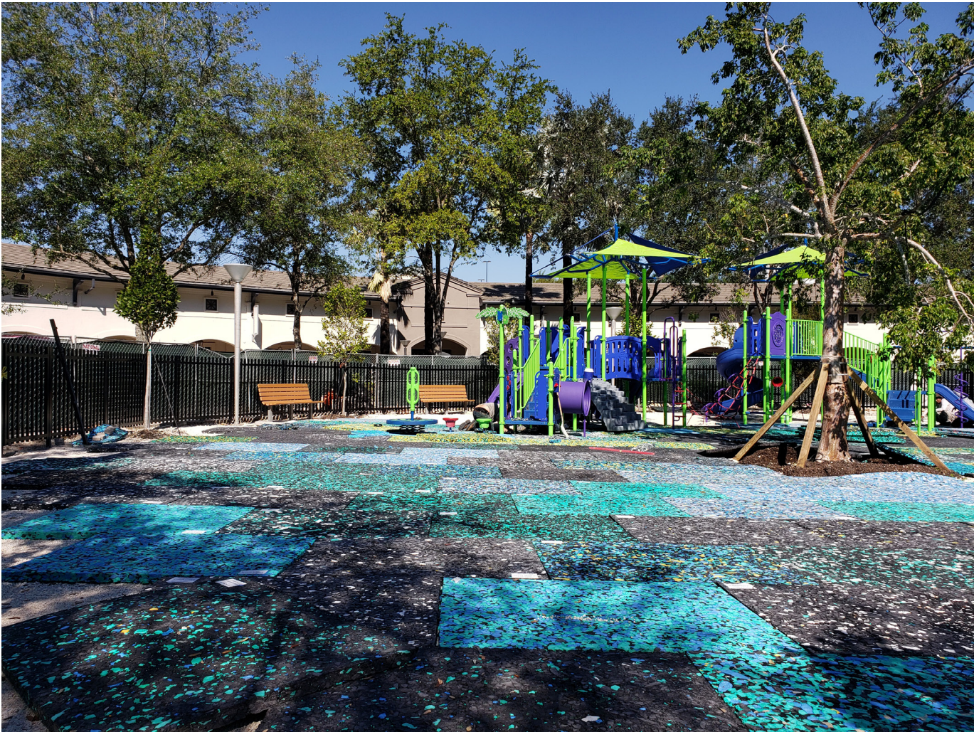
EXHIBIT D - MPARK