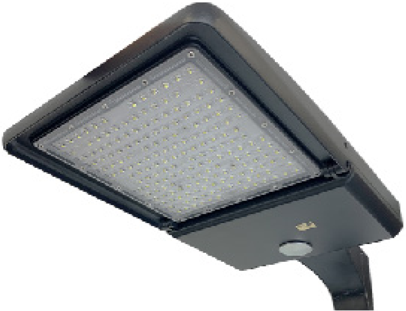
EXHIBIT A - LED LIGHT